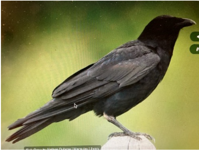
Fish Crows - It's a Florida kind of sound.

You cross the Florida/Georgia line, pull into the Welcome Center, eager to stretch your legs and taste the fresh Florida orange juice, and you hear it. The raspy ca-hah of the fish crow welcomes you to the state of Florida.