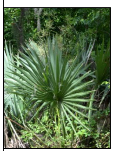
NATURE at OCEAN RESORTS: THE SAW PALMETTO by Linda Smolarek

Saw Palmetto grows wild in Florida's natural areas, commonly along the south Atlantic and Gulf Coastal plains and sand hills. It is a useful plant for home landscapes throughout the state.