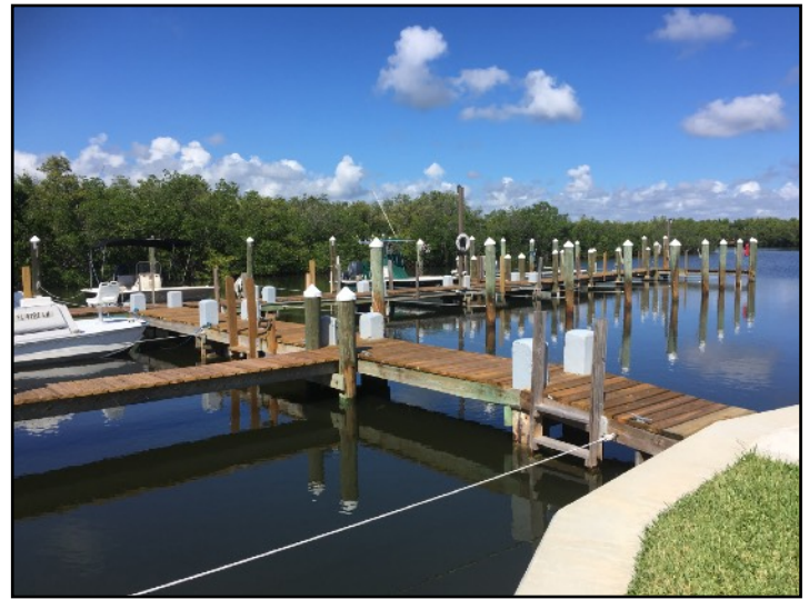
New Decking at the Marina